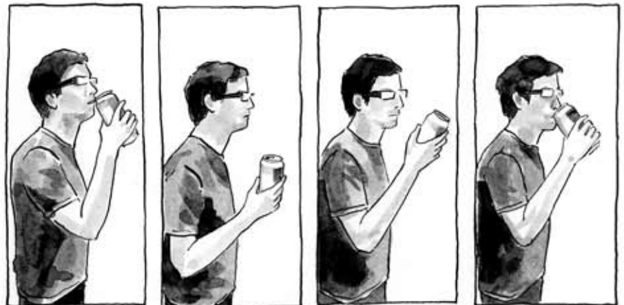
MY ENJOYMENT OF THIS MID-PRICE BEER