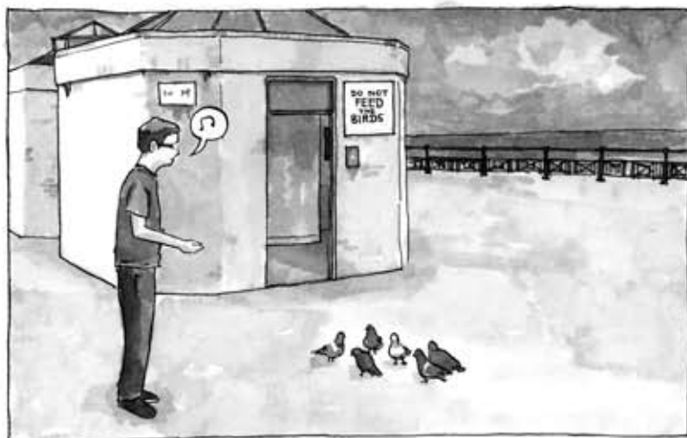
STEPPING STONES INTO A LIFE OF CRIME