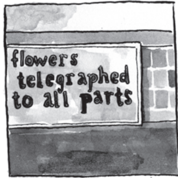
IT'S JUST THOSE HAND PAINTED LETTERS WERE SO MUCH BETTER THAN THE GENERIC DIE CUT STUFF YOU SEE TODAY. I GUESS I'M AN IMPERFECTIONIST