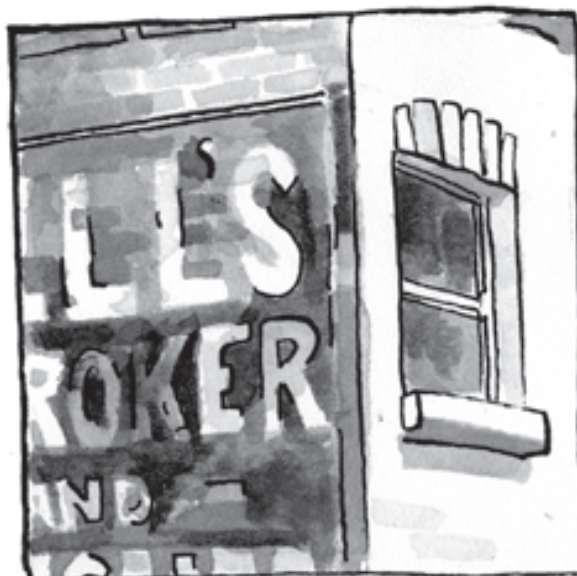
I LIKE EM. WINDOWS INTO THE PAST AND ALL THAT. IT'S NOT REALLY THE HISTORY THAT'S IMPORTANT TO ME.