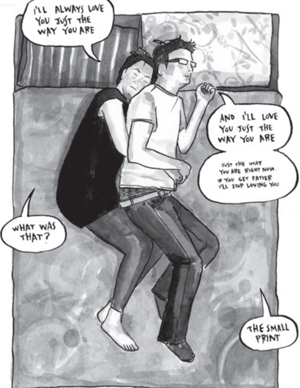
IT'S NOT TRUE, I WAS JOKING