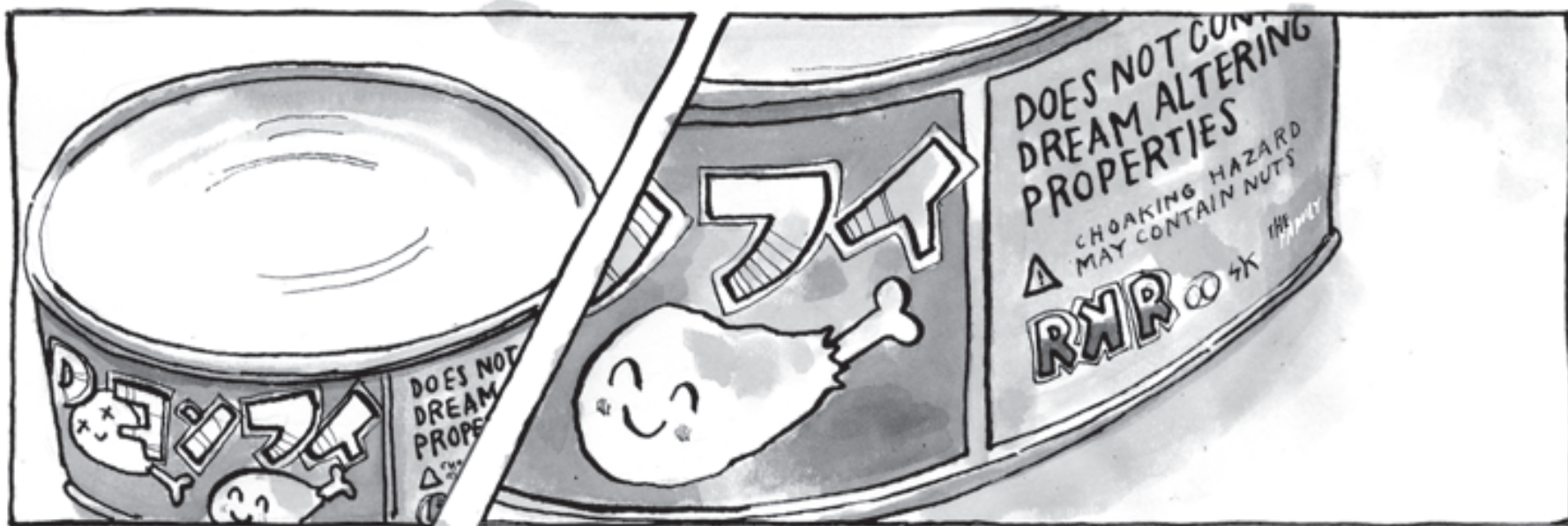
HE FALSELY BELIEVES IT HAS MAGIC POWERS THAT MAKE HIM SLEEP DEEPER