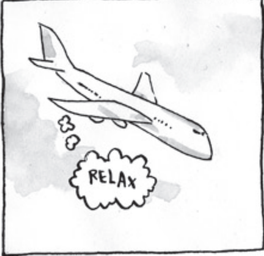
I CAN ONLY RELAX ONCE I'VE CONVINCED MYSELF THE FLOODED BATH WATER WILL PUT OUT THE FIRE STARTED BY THE IRON.