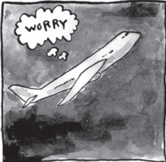
I'M A TERRIBLE WORRIER. FROM THE SECOND I GO ON HOLIDAY I START WORRYING ABOUT TWO THINGS...