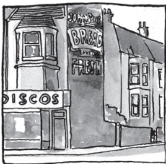
YOU KNOW THOSE OLD SIGNS AND ADVERTS YOU SOMETIMES SEE PAINTED ON WALLS?